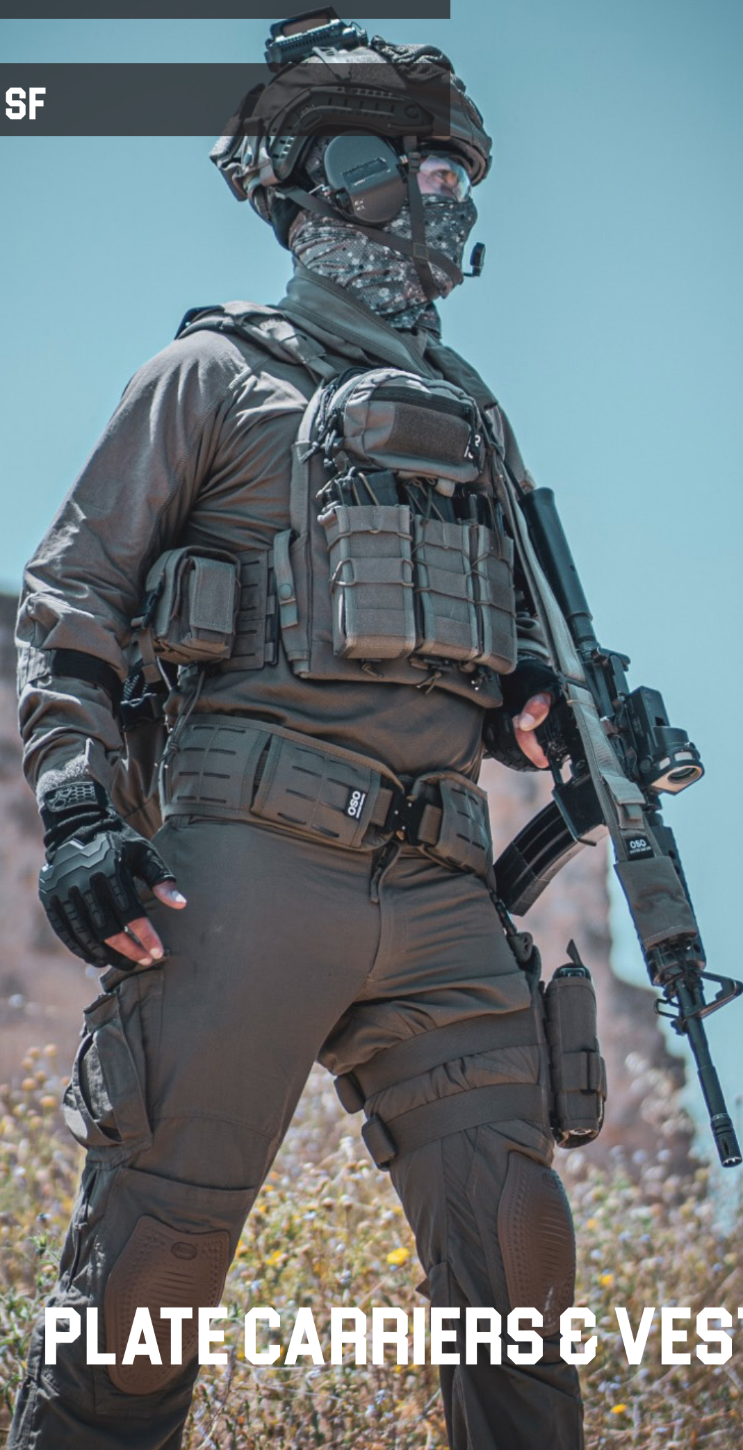
PLATE CARRIERS & VESTS