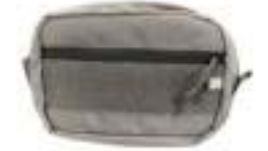
Horizontal Utility Pouch