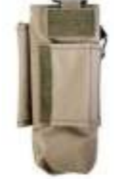
Communication IDF Pouch