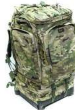
Platoon water Filter Carrier System