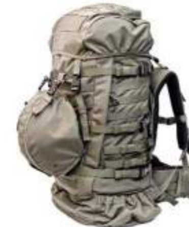
992 Backpack 90 L