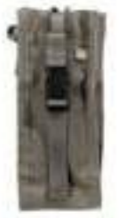
DF Communication Pouch