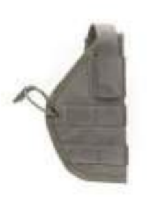
Small Pistol Holster