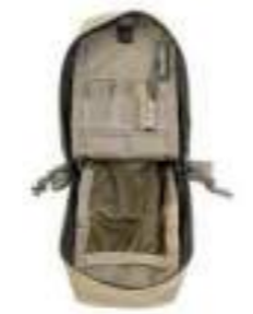
Vertical Utility Pouch