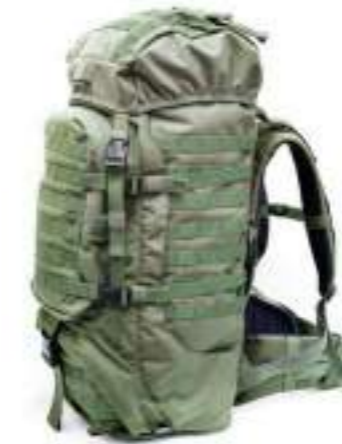
997 IDF Backpack 90 L