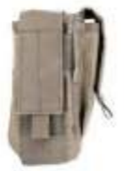
IDF Cartridge Pouch