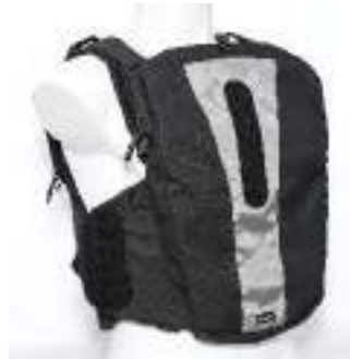
Ballistic Back Pack