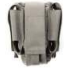
IDF Double Cartridge