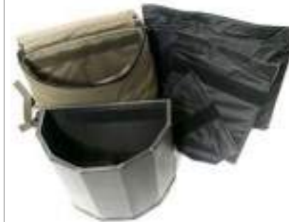
Drone Warrior Back Pack