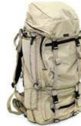
960 Backpack 60 L