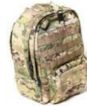
The Lior Mission Pack