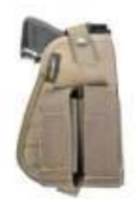
Advanced Pistol Pouch