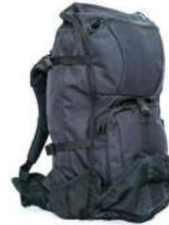
Mega Backpack 60 L