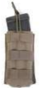
Single Cartridge Pouch